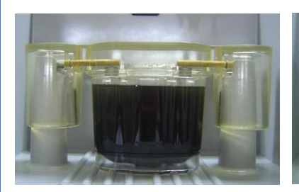
Transformer oil from OLTC Before and After maintenance.