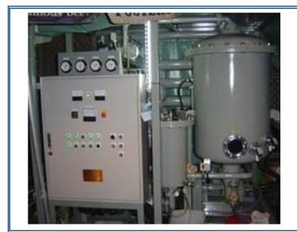
Oil filtration machine for oil treatment.

Transformer oil is usually clean and dry. However in a humid environment and overtime, moisture ingress into the transformer is possible through the conservator breather or from points of leakage. To dry and clean the transformer oil, it is necessary to deploy an oil treatment machine at site for filtration, degasification and removal of moisture. The oil treatment process will also help to dry the transformer insulation.